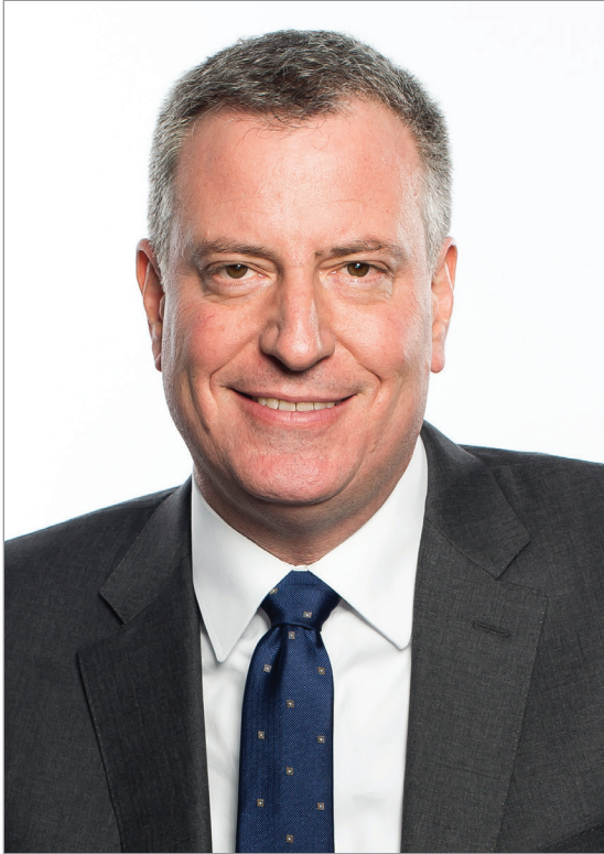
BILL DE BLASIO , Mayor of New York City

Public-private partnerships are one of the most powerful tools cities have in creating positive social change. The Mayor's Fund to Advance New York City continues to be an unparalleled leader in fostering partnerships to improve the lives of New Yorkers across the five boroughs.