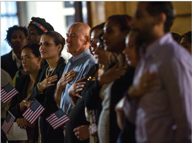
Mayor Bill de Blasio delivered remarks at a naturalization ceremony for 100 New Yorkers in celebration of Citizenship Day.

Along with creating opportunities for immigrant New Yorkers, the Mayor’s Fund is also working with the Mayor’s Office of Immigrant Affairs, the Department of Health and Mental Hygiene and the Center for Economic Opportunity to ensure equity in our city’s current health services. By supporting the new “Direct Access” health initiative with the Robin Hood Foundation, the Mayor’s Fund aims to help our city improve health care access for our immigrant population, making New York City one of the first major US municipalities to expand health care access after the enactment of the Affordable Care Act. The program will coordinate reliable and timely access to affordable care for immigrants who are excluded from federal and state support, meeting the vital needs of some of our most underserved residents—and in doing so, set the stage for a more inclusive health care system.