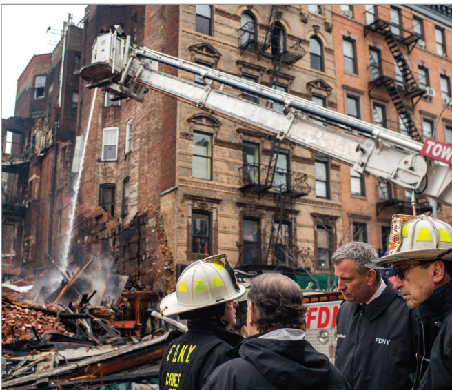
Mayor Bill de Blasio visited the site of the East Village explosion and buildings collapse on March 27, 2015.

Following the East Village building explosion on March 26, 2015, the Mayor’s Fund raised more than $175,000 from hundreds of everyday New Yorkers and corporate partners, including Con Edison, Gramercy Theatre and Irving Plaza, and Google, in support of those impacted by this tragedy. The Mayor’s Fund also partnered with Good Old Lower East Side and Lower East Side Ready to provide direct relief to individuals and families who resided in the five buildings damaged by the explosion.