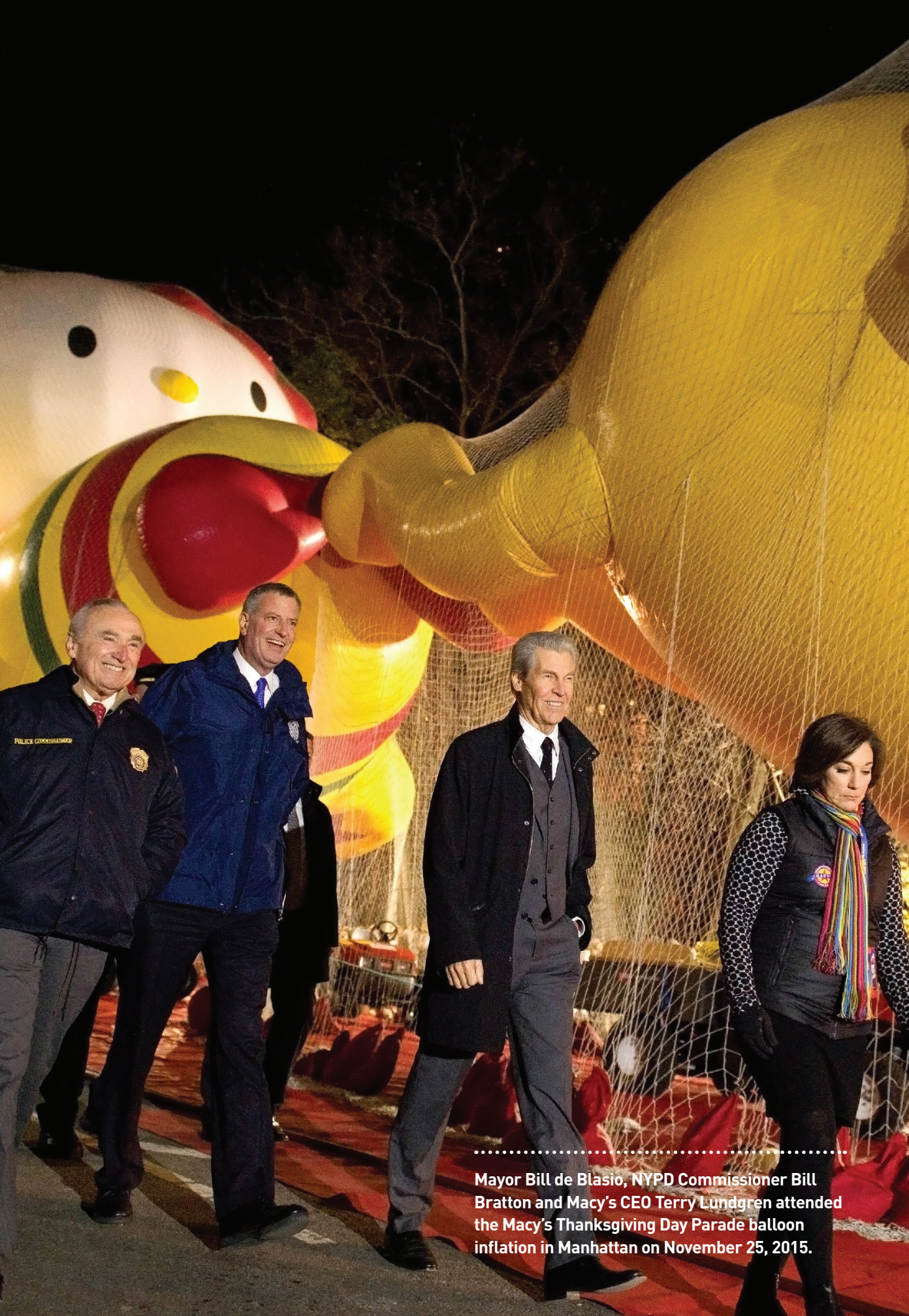
..... Mayor Bill de Blasio, NYPD Commissioner Bill Bratton and Macy's CEO Terry Lundgren attended the Macy's Thanksgiving Day Parade balloon inflation in Manhattan on November 25, 2015.