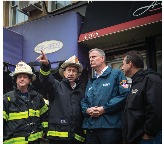
Mayor Bill de Blasio received an update on the building explosion in Borough Park on October 3, 2015.