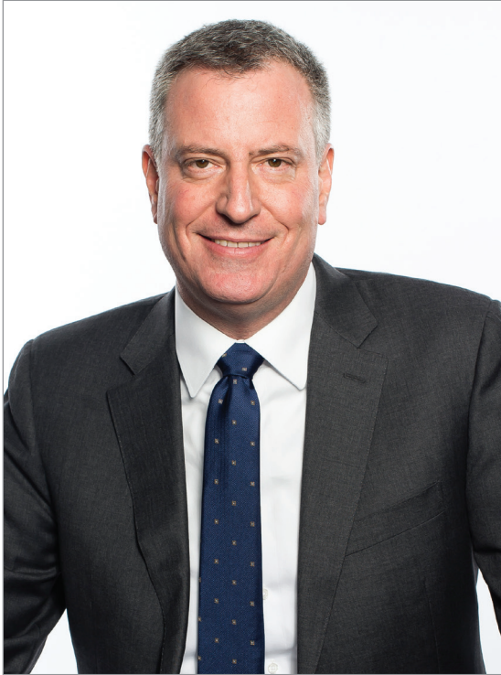
BILL DE BLASIO , Mayor

The inequality crisis is the most profound challenge of our time. We have set out ambitious goals to combat it, but we know we can't do it alone. Partnerships with philanthropy, business and everyday New Yorkers are a key component to overcoming many of our most stubborn challenges. The Mayor's Fund to Advance New York City is one of our most powerful tools to build strategic alliances and programs for change. That is why I asked Chirlane, my most trusted partner and advisor, to serve as the Fund's Chair.