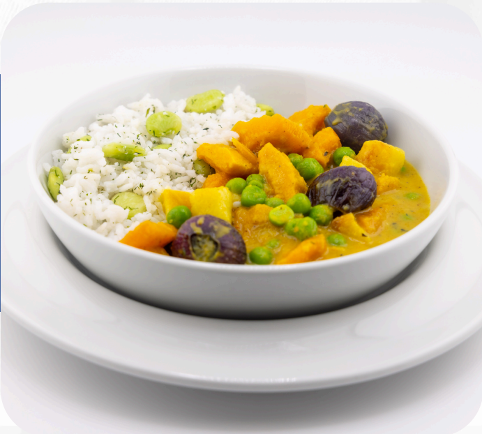
Kabocha Squash Curry with Lima Bean Rice

$59¢ saved per tray ($500,000 in the first year of implementation)