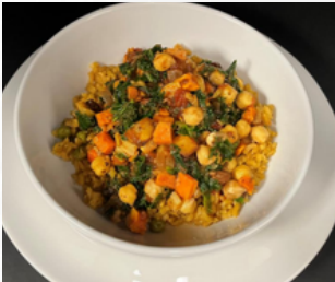
Moroccan Vegetable Tagine with Rice Pilaf