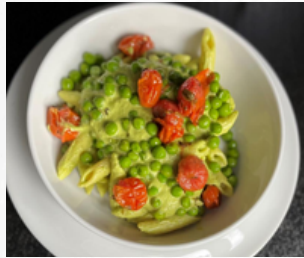
Pea Pesto Pasta with Roasted Tomatoes