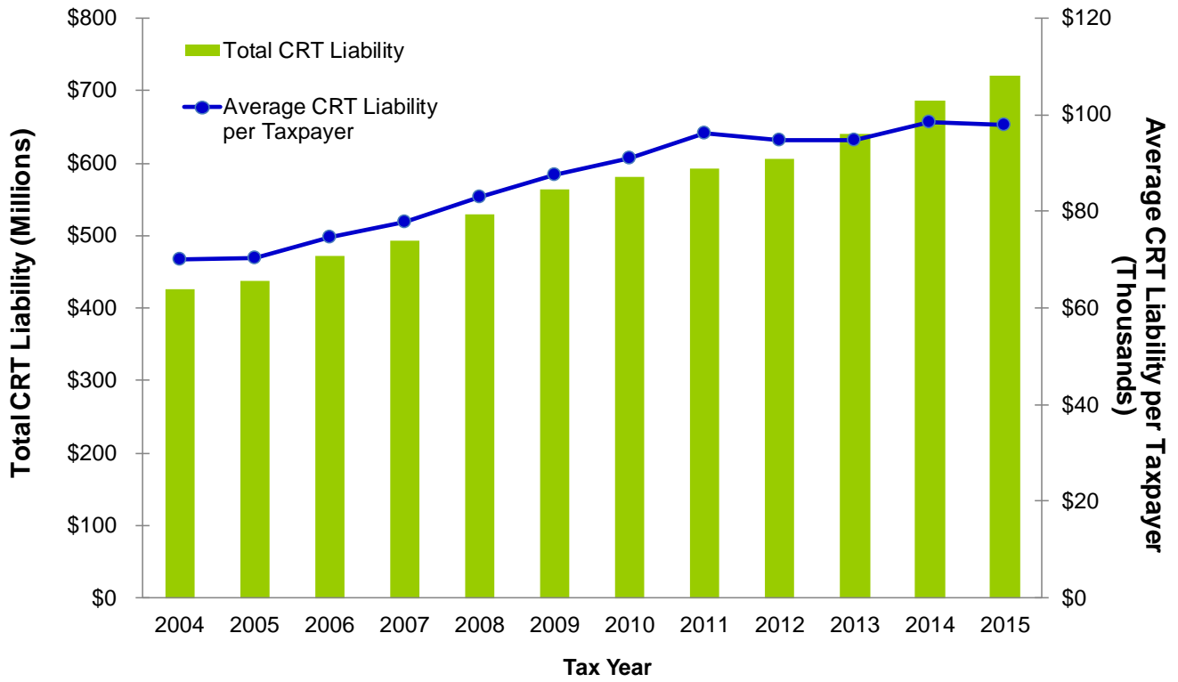
Figure 1 TAXPAYER LIABILITY TY 2004–TY 2015