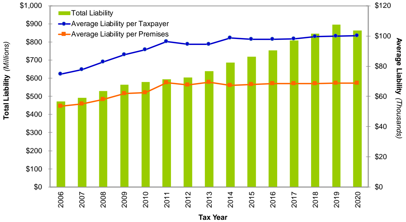
Figure 1 TAXPAYER AND PREMISES LIABILITY TY 2006 – TY 2020