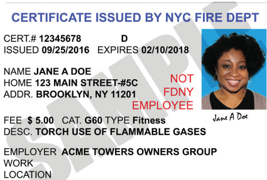
Sample Certificate of Fitness (COF) Card.

***Our office is closed on holidays. If you can't make walk-in hours, schedule an appointment by calling 718-999-1988 .