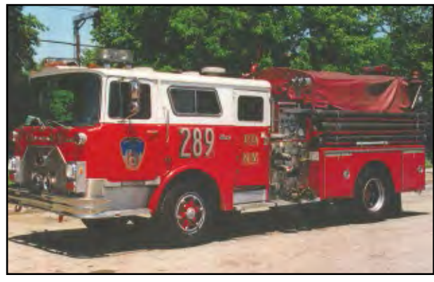
Engine 289 apparatus.

removed the man to the safety of the subway car, without specialized equipment or additional staffing. Courage and braverv difficult circumstances, quick thinking and teamwork easily describe the actions taken by Engine 289 members during this extremely difficult operation. The Department is proud to present the Lieutenant James Curran/New York Firefighters Burn Center Foundation Medal to the members of Engine 289.—APM