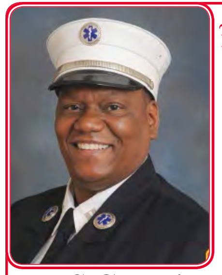
Lt. Kirby McElhearn Medal

September 14, 2015, 0610 hours, Brooklyn