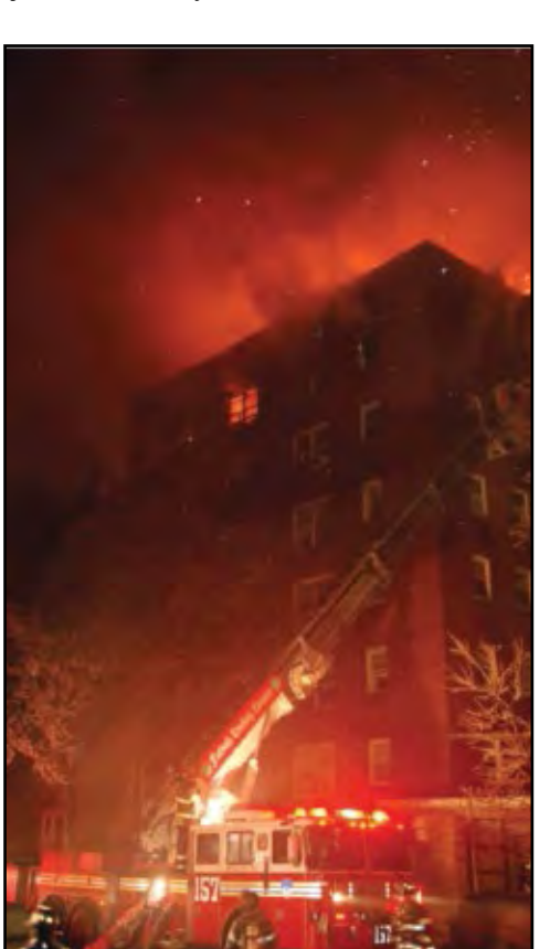
Ladder 157 operates at Brooklyn Box 55-2439, February 19, 2011.

The fire building was a two-story frame structure. Thick, black smoke from the second-floor windows boiled violently into the night sky. Lieutenant Sacco and his forcible entry team forced the front door and immediately, members were driven to the floor by the blast of high heat. The interior stairway to the second floor was impassable, fully involved in fire—floor to ceiling—with flames pushing through the roof skylight. This was an advanced, rapidly evolving fire.