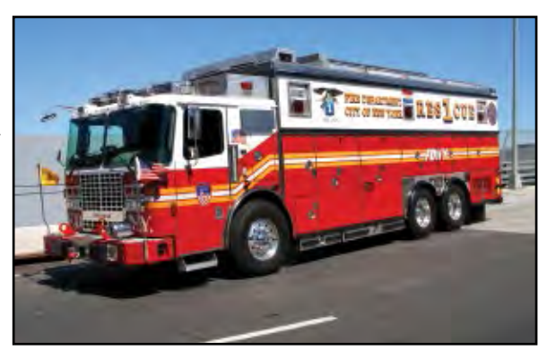
Rescue 1 apparatus. Photo by Joe Pinto

The members of Rescue 1 operated for approximately four hours in a dangerous, precarious building collapse site, with a constant threat of secondary collapse, to rescue a trapped worker. Through teamwork, cooperation and training, the members effected this rescue. For their outstanding actions, the above-listed Rescue 1 members are awarded the Firefighter Thomas R. Elsasser Memorial Medal.— AP