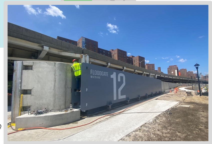
Flood Gate 12 installed at Stuyvesant Cove Park @ E. 20 th Street entrance