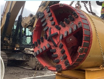
Microtunneling machine on site – December 2024