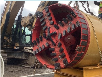
Microtunneling machine on site – December 2024