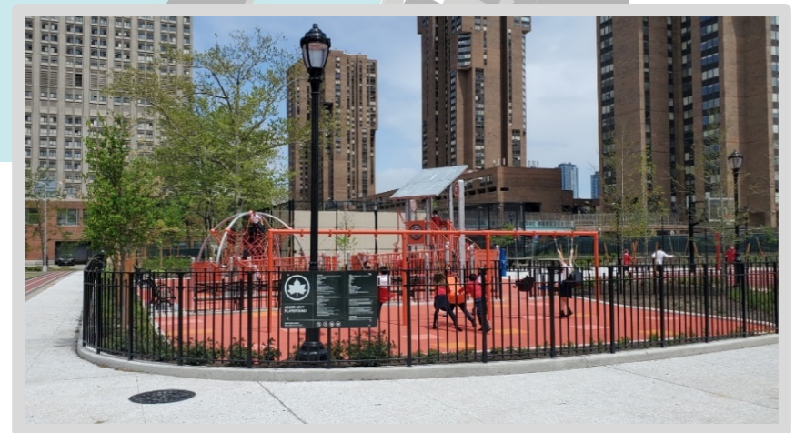
Asser Levy Playground open to the public