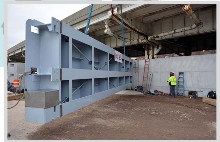
Operation 1: First floodgate installed at Stuyvesant Cove Park February 24, 2022.