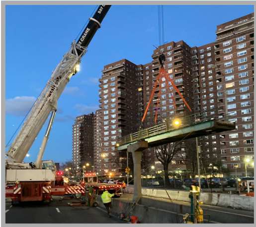
Delancey Street Pedestrian Bridge overnight dismantling on March 27, 2022

FOR ILLUSTRATIVE PURPOSES SUBJECT TO MODIFICATIONS