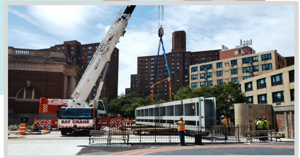
Floodgate 18 installed at Asser Levy Playground