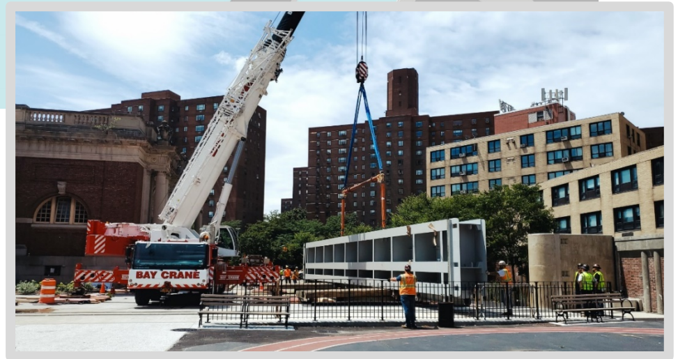
Floodgate 18 installed at Asser Levy Playground