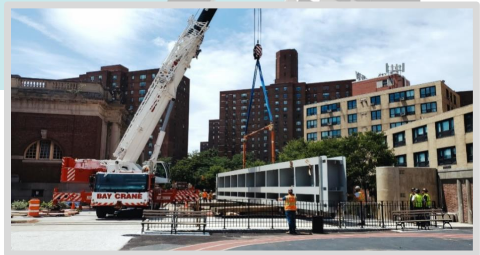
Floodgate 18 installed at Asser Levy Playground