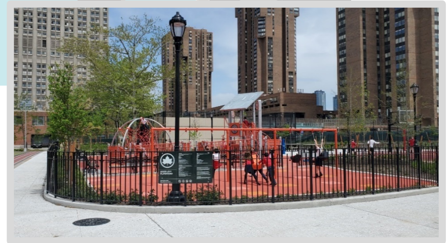
Asser Levy Playground open to the public