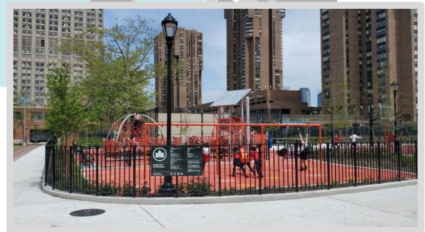
Asser Levy Playground open to the public