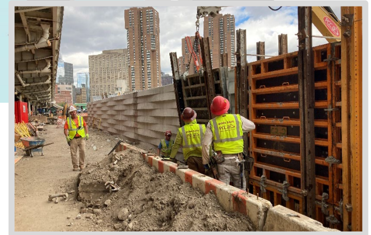
Operation 1: Ongoing floodwall construction in Stuyvesant Cove Park.