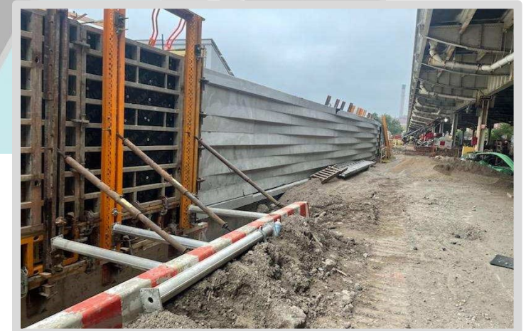
Operation 1: Ongoing floodwall construction in Stuyvesant Cove Park.