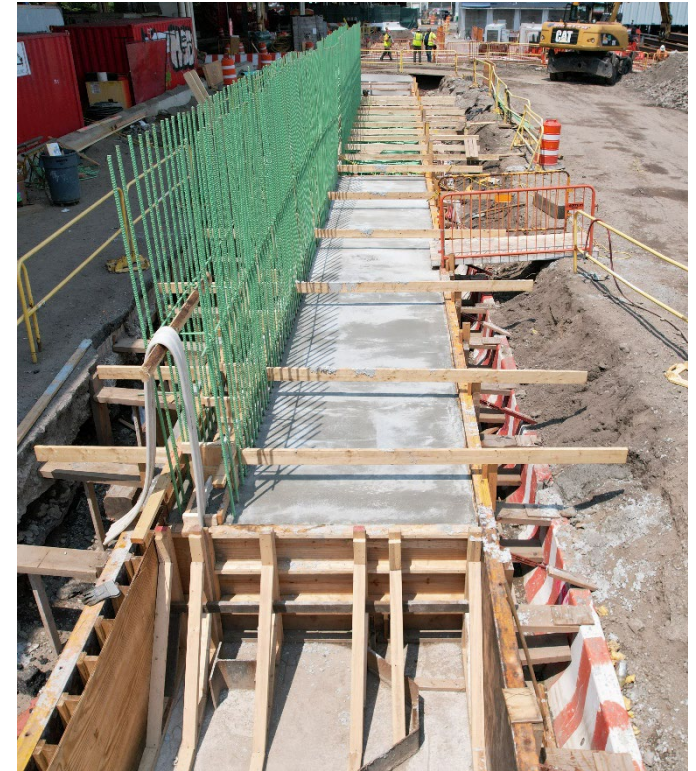
Operation 1: Flood wall foundation work progresses.