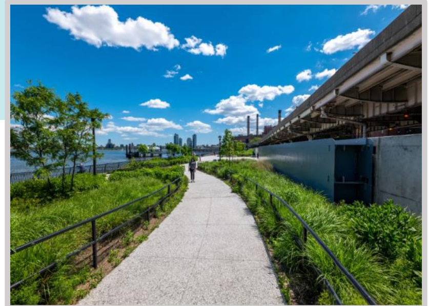
Stuyvesant Cove Park – May 2025