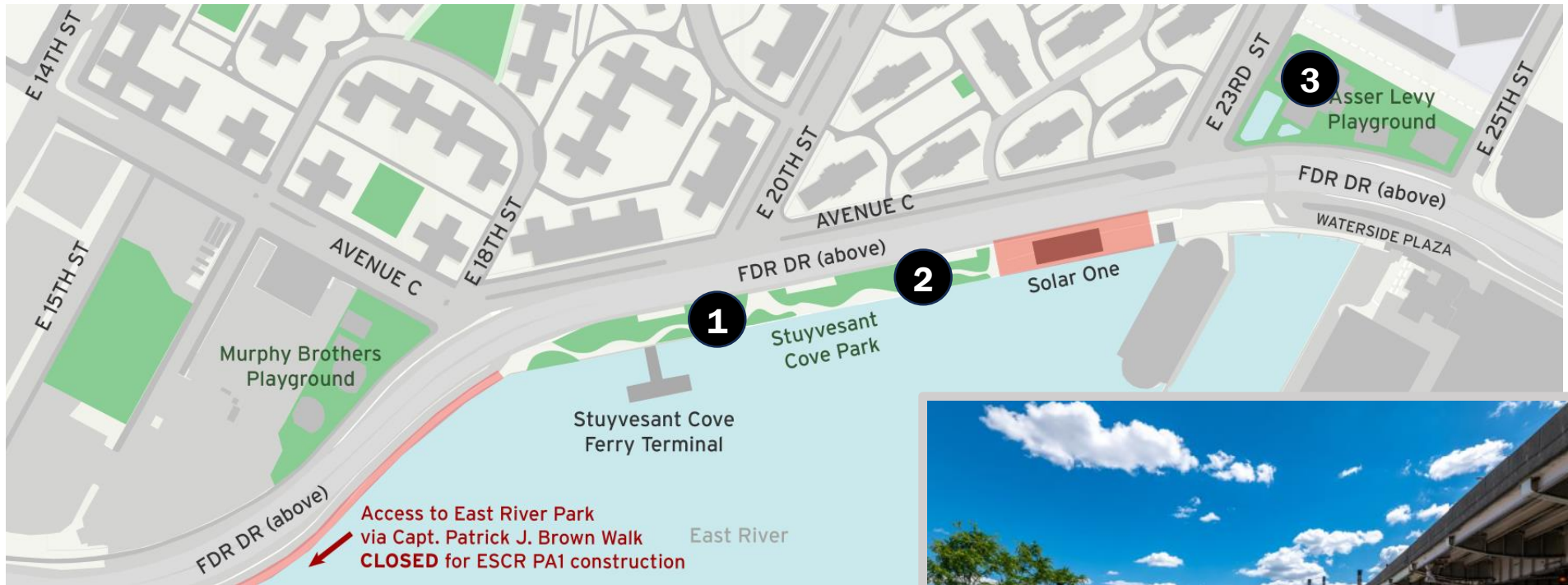
Stuyvesant Cove Park – May 2025