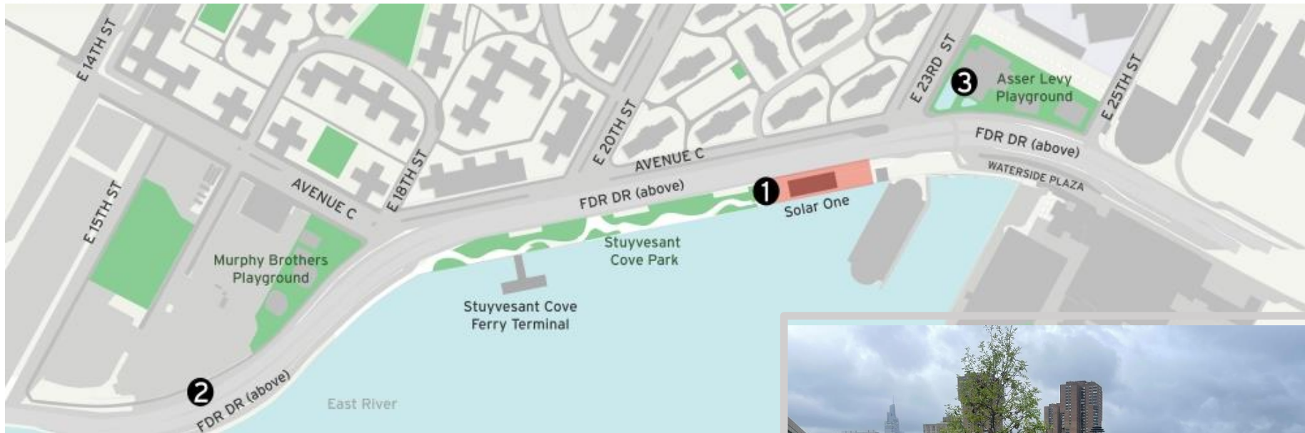
Stuyvesant Cove Park – May 2024