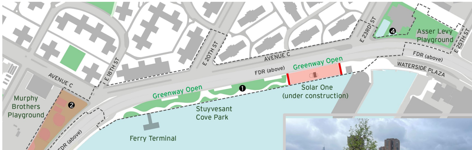
Stuyvesant Cove Park – May 2024