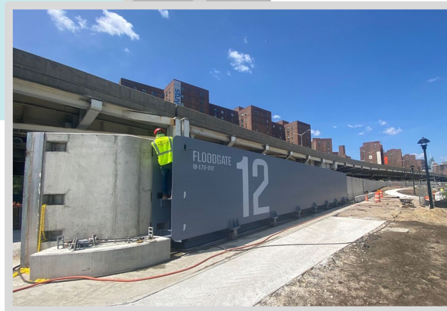
Flood Gate 12 installed at Stuyvesant Cove Park @ E. 20 th Street entrance