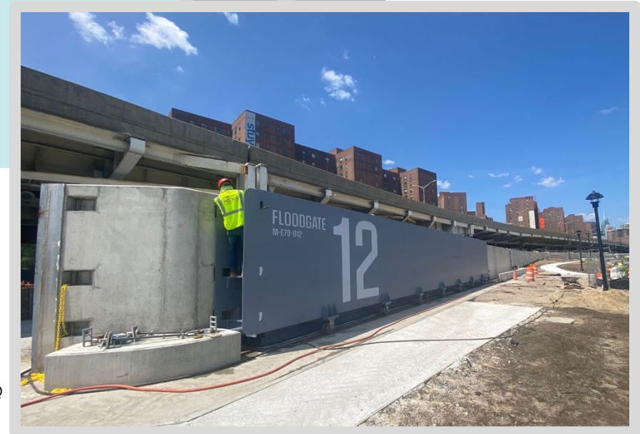
Flood Gate 12 installed at Stuyvesant Cove Park @ E. 20 th Street entrance