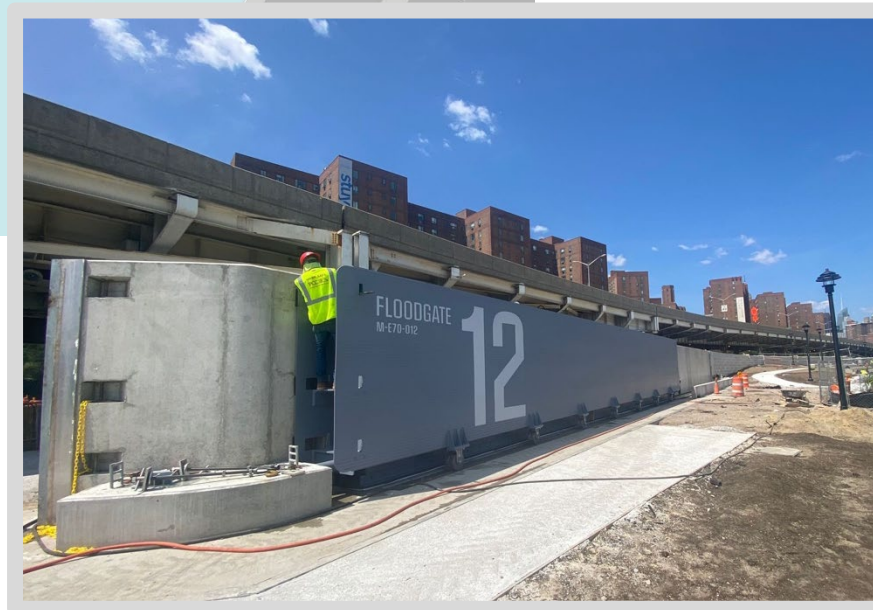
Flood Gate 12 installed at Stuyvesant Cove Park @ E. 20 th Street entrance

For More Information: Contact Nadine Harris at (347) 572-3057, ESCRCL2@ddccr.com , or via web inquiry: www.nyc.gov/escr/contact During non-construction hours, please contact the New York City Government Services and Information Hotline at 311 .