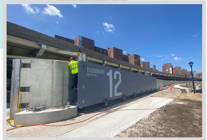
Flood Gate 12 installed at Stuyvesant Cove Park @ E. 20 th Street entrance

For More Information: Contact Nadine Harris at (347) 572-3057, ESCRCL2@ddccr.com , or via web inquiry: www.nyc.gov/escr/contact During non-construction hours, please contact the New York City Government Services and Information Hotline at 311 .