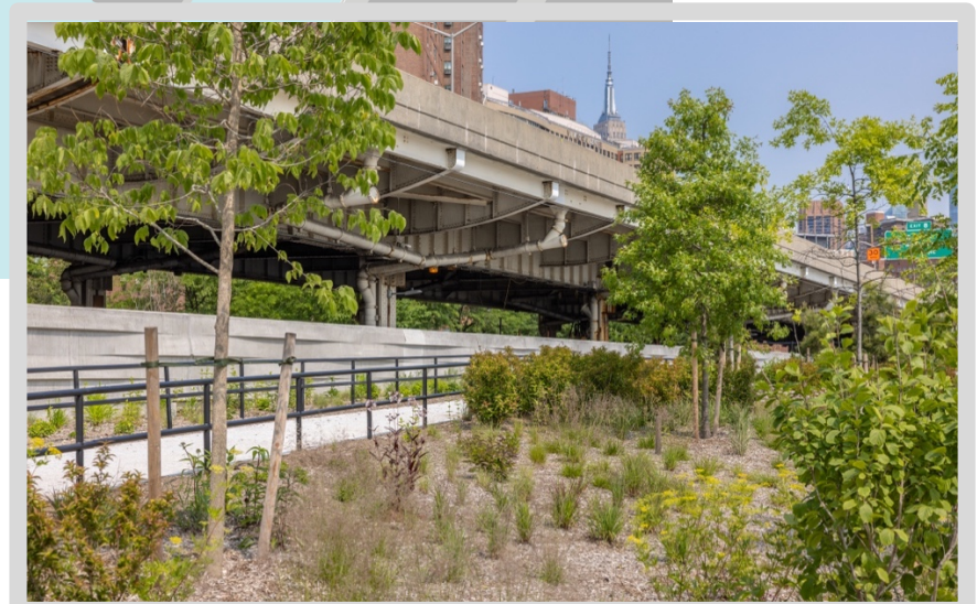
Stuyvesant Cove Park north of E. 20 th St. reopen to the public.