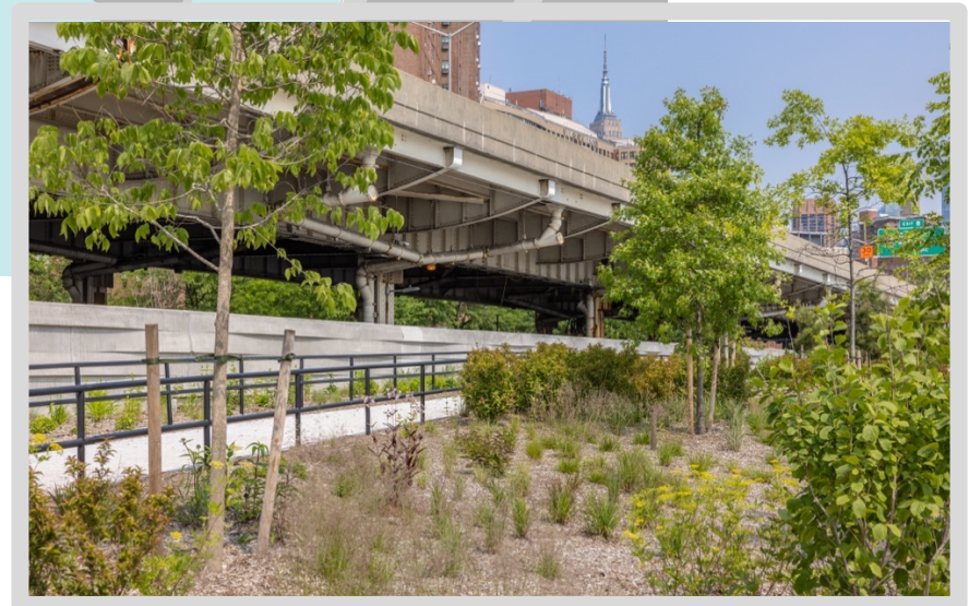
Stuyvesant Cove Park north of E. 20 th St. reopen to the public.