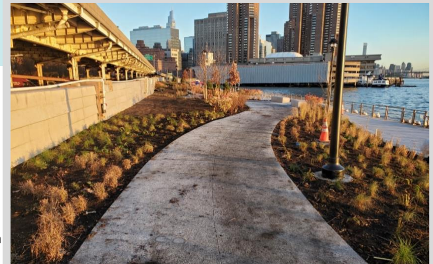
Stuyvesant Cove Park (Northern part) site restoration in progress - November 2022