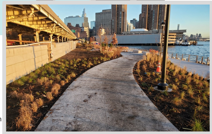
Stuyvesant Cove Park (Northern part) site restoration in progress - November 2022