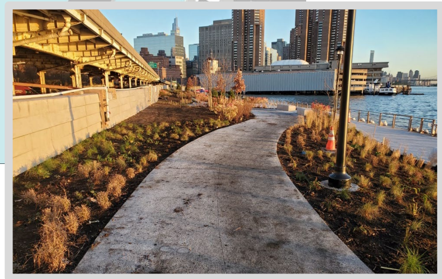
Stuyvesant Cove Park (Northern part) site restoration in progress, November 2022