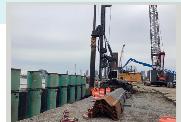
Combi-wall installation in East River Park, April 2023