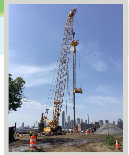
Soil Stabilization at East River Park waterfront, July 2022