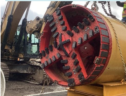
Microtunneling machine on site – December 2024

Questions? ¿Preguntas? 问题?: Contact Vanessa Gomez at (347) 628-8724 or ESCRCL1@ddccr.com , or via web inquiry: www.nyc.gov/escr/contact .