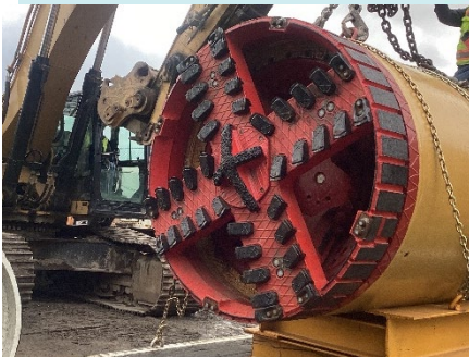
Microtunneling machine on site - December 2024

Questions? ¿Preguntas? 问题?: Contact Vanessa Gomez at (347) 628-8724 or ESCRCL1@ddcr.com , or via web inquiry: www.nyc.gov/escr/contact .