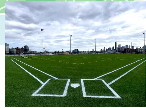
Ballfields 1 & 2 - September 2024

Questions? Preguntas? 问题?: Contact Vanessa Gomez at (347) 628-8724 or ESCRCCL1@ddccr.com , or via web inquiry: www.nyc.gov/escr/contact . During non-construction hours, please contact the New York City Government Services and Information Hotline at 311 or Universal Emergency Number 911 .