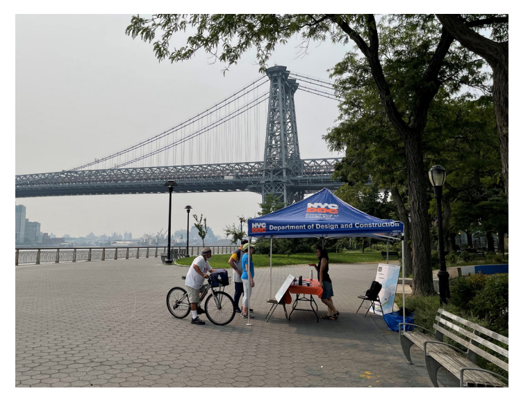
Our Community Engagement team has been in Stuyvesant Cove Park and East River Park monthly to share project information and answer questions about upcoming construction.