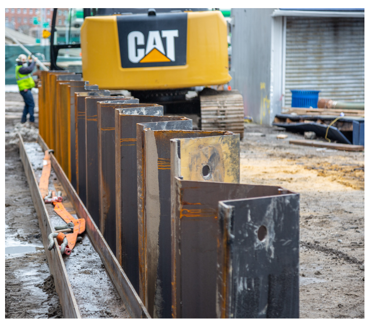
Sheet pile installation in Stuyvesant Cove Park

H-Piles, which have an H-shaped profile, act as structural support for the floodwall foundations. They are the longest of the piles used and are driven into the earth by special pile driving equipment. At Stuyvesant Cove Park near Solar One, the H-piles go as deep as 120'.