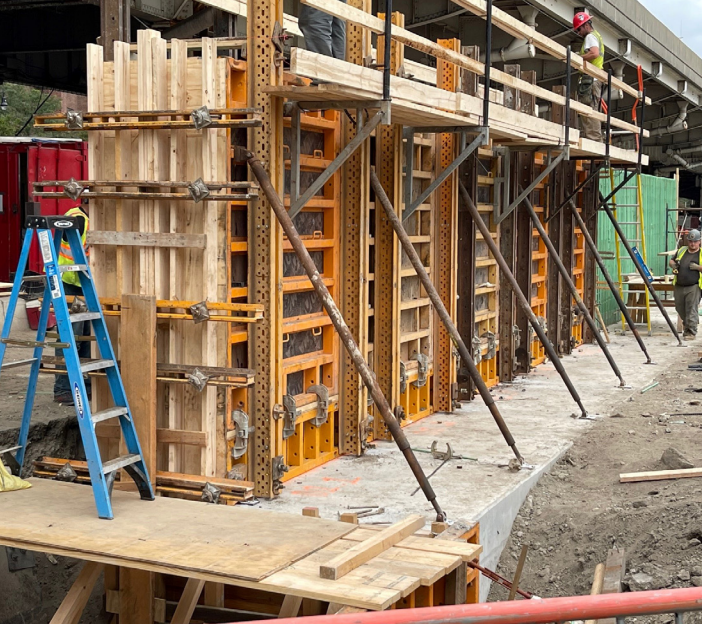
Foundation and formwork for the first section of floodwall in Stuyvesant Cove Park.