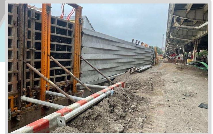
Operation 2: Ongoing floodwall construction in Stuyvesant Cove Park.