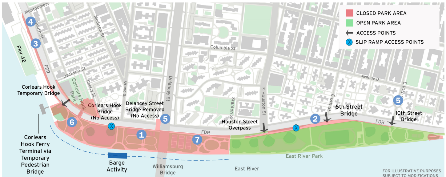
Project Area 1 (PA1) Construction Area, October 2022

FOR ILLUSTRATIVE PURPOSES SUBJECT TO MODIFICATIONS