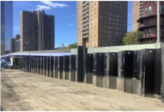
Sheet Pile for floodwall along the Greenway, October 2022 ( Activity #3)