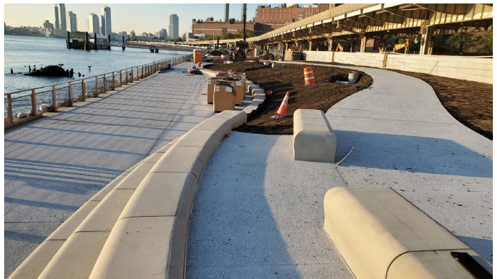
Stuyvesant Cove Park (Northern parj) construction in progress, October 2022

To date, over 1,200 linear feet of floodwall has been installed in the project area! Floodgate 17 at the West Service Road is in progress and Floodgates 15 & 16 at E. 23rd Street intersection are scheduled for next year. Site restoration for Stuyvesant Cove Park north of E. 20th Street is underway and scheduled to reopen early next year.