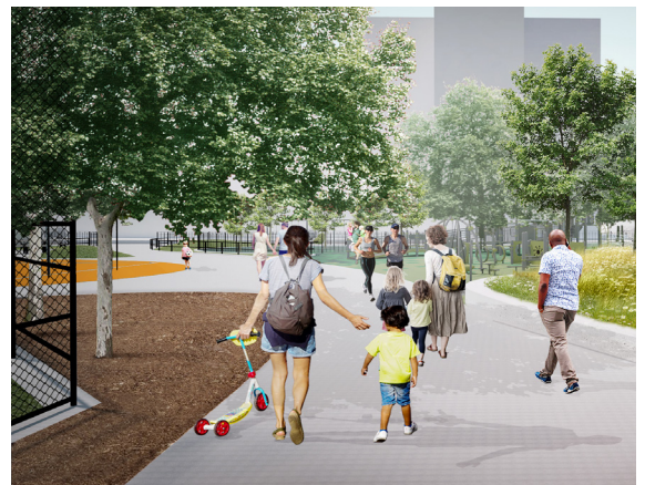
Murphy Brothers Playground rendering