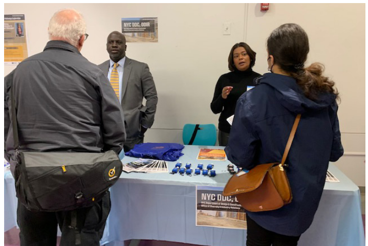
DDC ODIR at ESCR In-person Quarterly Information Event on October 19, 2022

In this quarter, the ESCR team also participated in DDC East Side Coastal Resiliency Forum: Meet the Teams Presentation on September 28, 2022. Program Management and Construction Management (PMCM) and contractor teams from ESCR and BMCR (Brooklyn Bridge-Montgomery Coastal Resiliency) presented the projects at the forum. The presentation is available on the ESCR website.