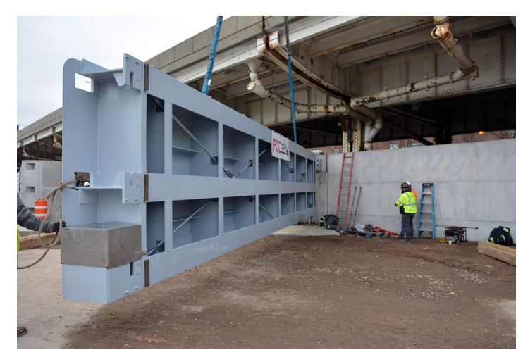
Stuyvesant Cove Park Vehicular Swing Gate install 2/24/2022

The contractor is working to complete floodwall operations and bulkhead rehabilitation. Later this year, the contractor will begin site preparations for the upcoming construction activities in Murphy Brothers Playground and the southern portion of Stuyvesant Cove Park.