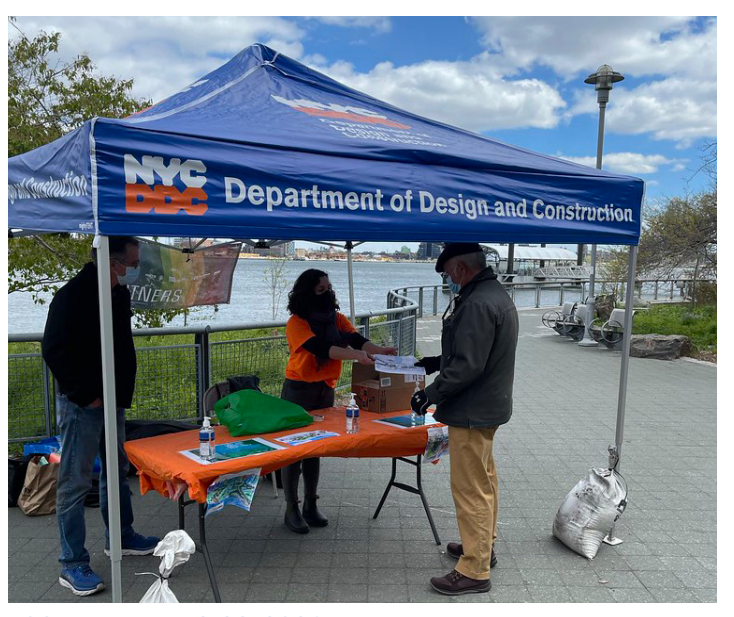
ESCR Earth Day 4/22/2021