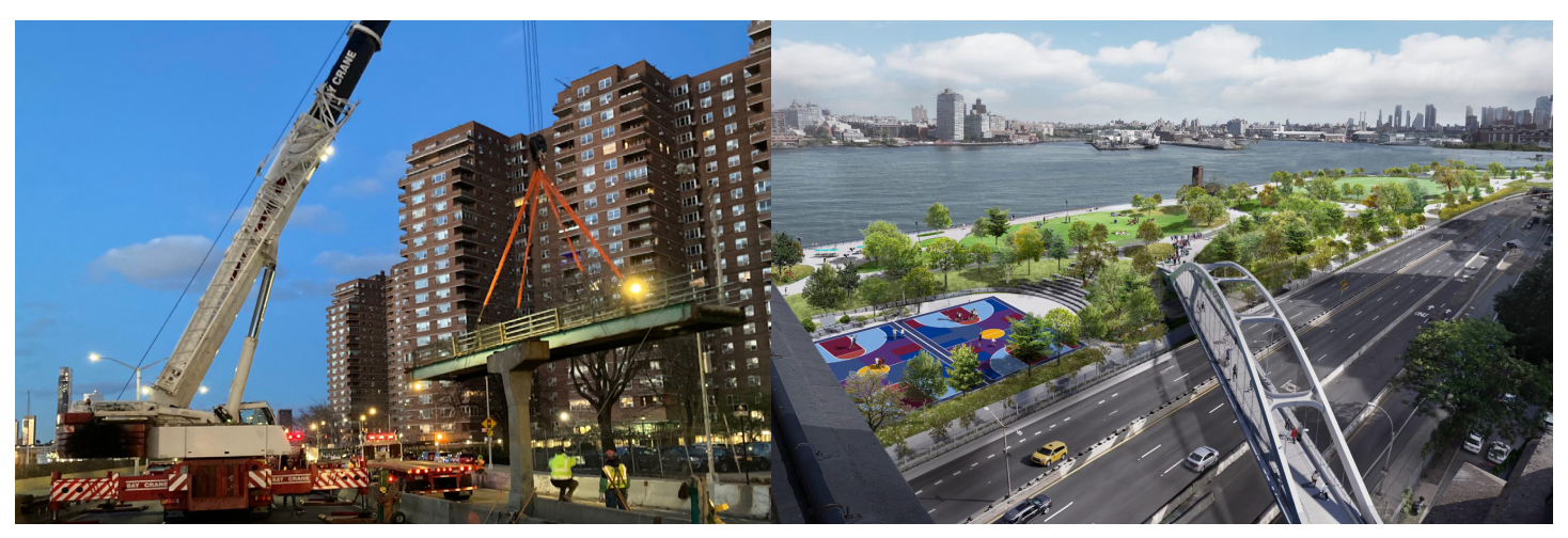
Delancey Street Pedestrian Bridge dismantling work