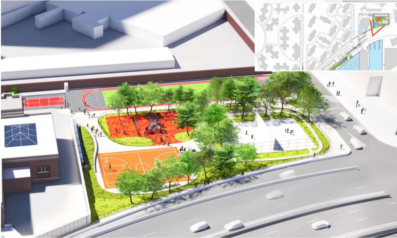
Asser Levy Playground