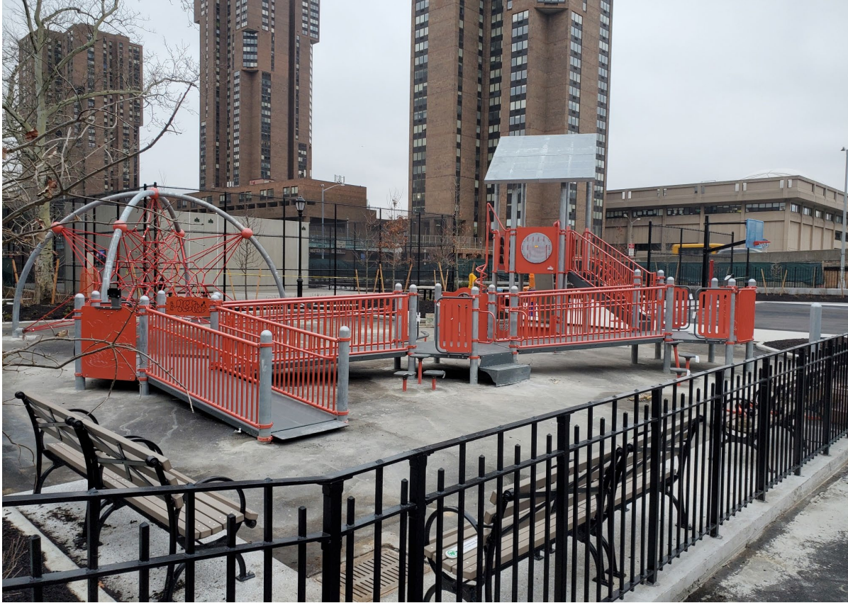
Asser Levy Playground April 2022