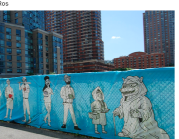
Hunters Point Library Construction Fence by DDC