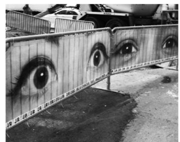
DDC Creative Services, Times Square Alliance