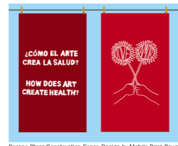
Corona Plaza Construction Fence Design by Mobile Print Po Queens Museum, DOT Art