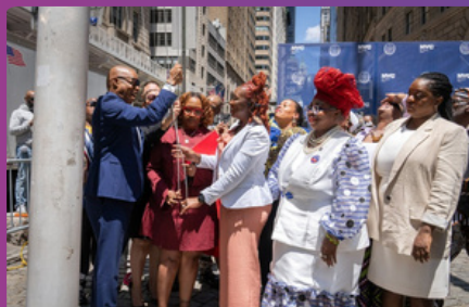
Mayor Adams, Commissioner Sherman, and community members raise the Juneteenth flag

Read the Commissioner's full remarks here.