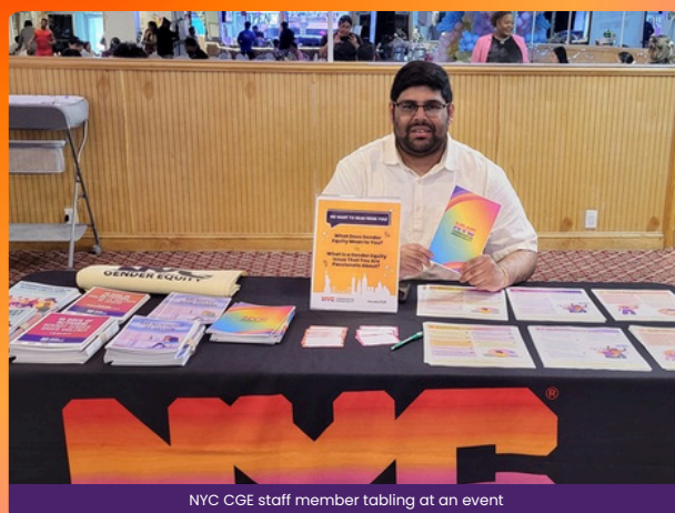
NYC CGE staff member tabling at an event

The NYC Commission on Gender Equity (CGE) participated in two public engagement events, the Mixteca Street Harassment presentation and the Caribbean Equality Project Little Guyana Pride event, to connect directly with local residents and share vital city resources. These gatherings created space for community dialogue, raised awareness about gender equity initiatives, and helped ensure that New Yorkers are informed, supported, and heard.