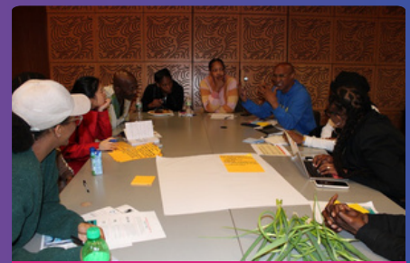
Participants discussed what reparations meant to them

This community event brought New Yorkers together to share stories, ideas, and visions for a more just future. The attendees helped shape the guiding principles for the city's reparations study and inform broader efforts around truth, healing, and reconciliation.