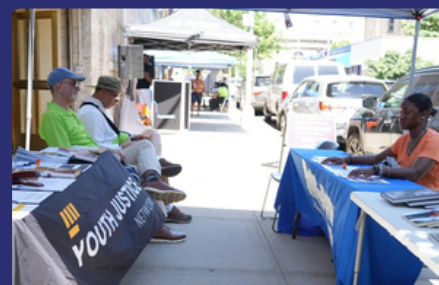
City agencies and organizations connected New Yorkers to resources

The NYC Young Men's Initiative (YMI) and the NYC Department of Youth and Community Development (DYCD) partnered with Forestdale, Inc. and Youth Justice Network for Spring Into Health: 2025, a citywide event series offering holistic health resources to communities across the five boroughs.