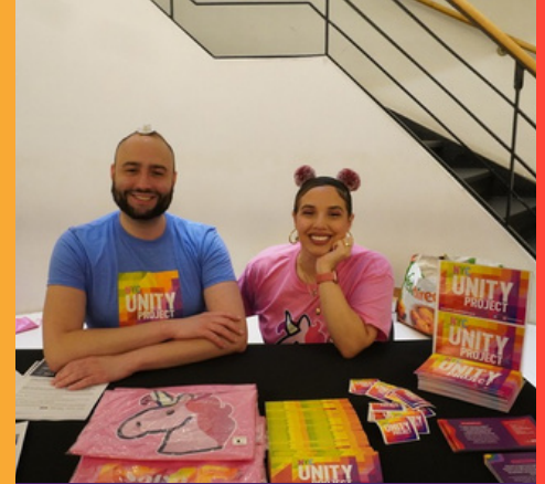
NYC Unity Project staff tabling at The Center