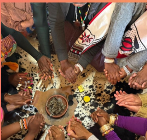
NYC Her Future hosted Rites of Passage events focused on community, health, wellness, and self-esteem