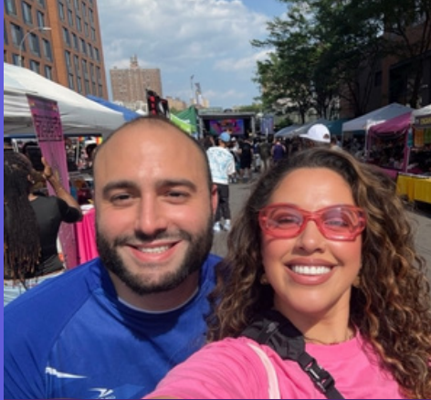
NYC Unity Project staff pose for a selfie

This Pride Month, the NYC Unity Project showed up (and out) across all five boroughs, participating in a number of events to stand with and serve LGBTQ+ New Yorkers with #Pride, purpose, and community. From resource sharing to community building, the NYC Unity Project ensured that all LGBTQ+ individuals felt seen, supported, and empowered across all generations. Learn more about their ongoing work at NYC.Gov/Unity .