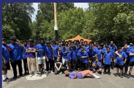
Participants posed for a group photo

The NYC Young Men's Initiative, in partnership with the NYC Department of Youth & Community Development (DYCD), hosted its Youth Leadership Summit to empower young men of color in grades 5-12.