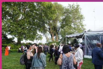
Attendees at Gracie Mansion