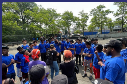
Participants getting hyped up for the day

The YMI service day continues to be a powerful example of how service can build community, character, and pride across NYC.