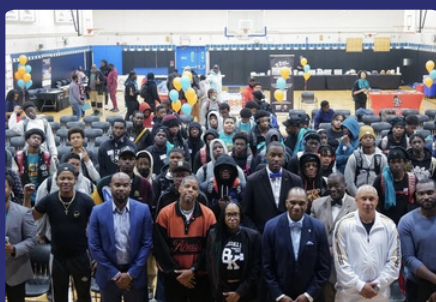
Participants posed for a photo