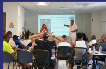
Attendees at a health and wellness workshop

From wellness screenings to health insurance enrollment, YMI continues to break down barriers and build pathways to healthier, more equitable futures for men and their families throughout New York City.