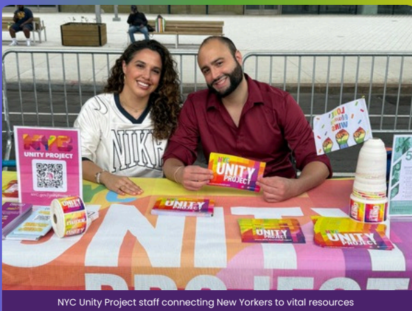
NYC Unity Project staff connecting New Yorkers to vital resources

The NYC Unity Project joined the community at Harlem Pride to celebrate and support LGBTQ+ New Yorkers. Onsite the Unity team shared resources, connected with local residents, and uplifted the voices and experiences of LGBTQ+ youth and families across the city.