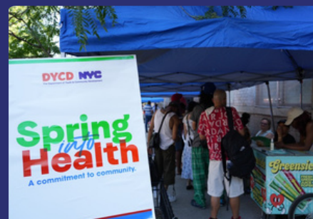
NYC YMI and NYC DYCD hosting Spring Into Health 2025