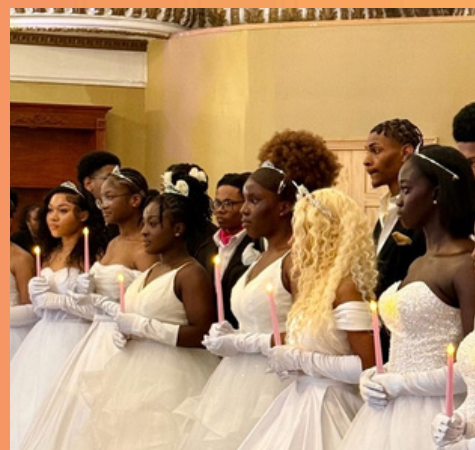
My Sister's Keeper members participating in a debutante ball

Diverse communities are the lifeblood of New York City, vibrant, creative, and deeply rooted in resilience. Even in the face of systemic racism and repeated adversity, they continue to find joy, build families, deepen bonds, and rise.