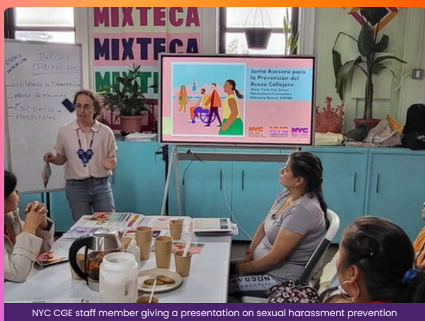
NYC CGE staff member giving a presentation on sexual harassment prevention

Strong women are rooted in strong girls, and to reinforce this truth, NHF recently hosted, in partnership with NYC Public Schools, NYC Her Future's "Rites of Passage" debutante balls centered on creating supporting and affirming environments that allow young women and girls of color to experience an important milestone of growth and step into their authentic selves.