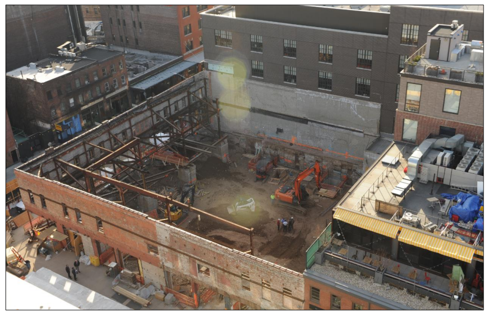
Pictured: 9-19 Ninth Avenue on the day of April 6, 2015

Defendants Accused of Failing to Heed and Address Repeated Warnings About Unsafe Work Conditions, Contributing to Worksite Cave-In and Death of Worker