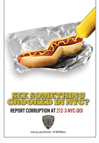
Posters from DOI's 2013 media campaign.

Center for the Advancement of Public Integrity