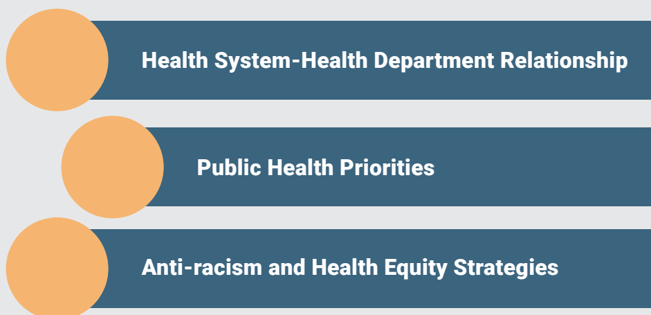
Figure 4: Listening Tour Topics

and anti-racist themes into their strategic planning around care delivery. Finally, all sites offered examples of areas for potential collaboration with the CMO. (See Appendix C for listening tour questions.)