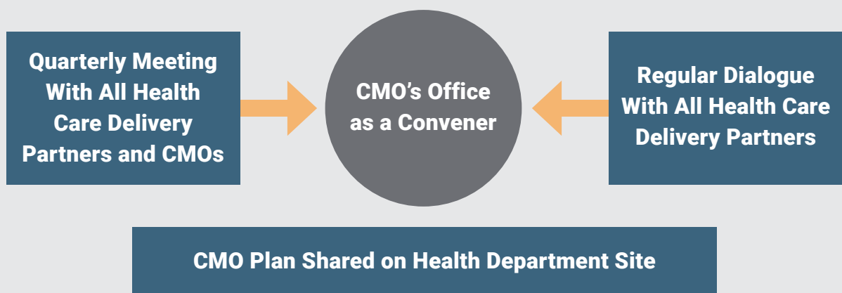
Figure 6: CMO and Health Care Delivery Partners Touchpoints

Between meetings, the CMO will provide newsletter updates on progress-to-date, with a focus on success stories across health care delivery partners and on best practices to navigating common challenges. In addition, the CMO will continue to strengthen the Health Department's relationships with health care system leads through one-on-one conversations. Because health care delivery partners already have well-established intra-organizational pathways to distribute information such as intranet communications and newsletters, the CMO will work to leverage internal communication routes to stay connected to health system staff.