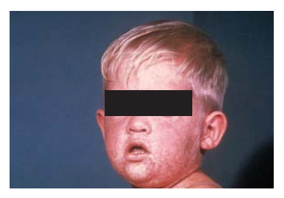
CDC PHIL Photo ID#1150. https://www.cdc.gov/ measles/about/photos. html